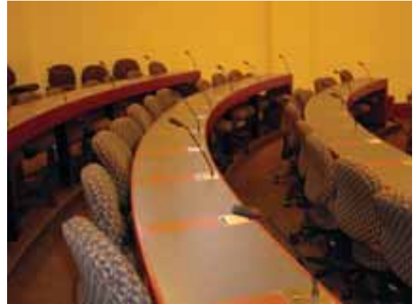
Austin Hall Classroom

Discussion systems provide reliable audio support for instructors to deliver their sessions clearly and efficiently. Students and instructor can have a controlled dialogue and all the students can hear discussions clearly.